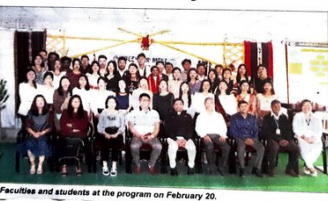
Faculty and students at the program on February 20.