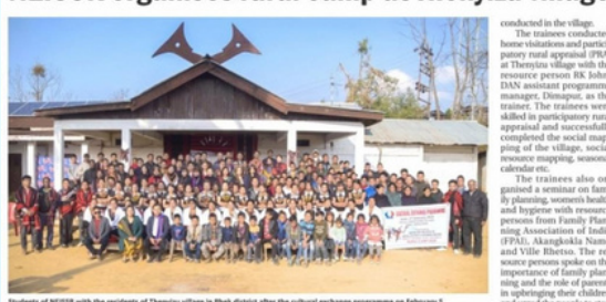
Students of NEISSR with the residents of Thenyizu village in Phek district after the cultural exchange programme on February 5.

Dimapur, Feb. 7 (EMN): A 10-day rural camp of the North East Institute of Social Sciences and Research (NEISSR) at Thenyizu village in Phek district concluded on February 5. Integral component of Masters in Social Work (MSW) curriculum in which 49 students of second semester and two faculty members along with Phek district rural camp, an update from NEISSR stated. The camp was organised with the objective of helping the social work trainees to understand rural realities and to develop a rural appraisal (PRA) and activities such as household survey and awareness programme on family planning, women's health and hygiene, awareness on peace building, and other social issues. Besides clarifying on the misconception of micro-entrepreneurship, women's health and hygiene, awareness on peace building, and other social issues.