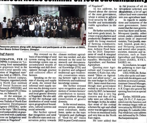
Resource persons along with delegates and participants at the seminar at DBDIL, Don Bosco School Campus, Dimapur.