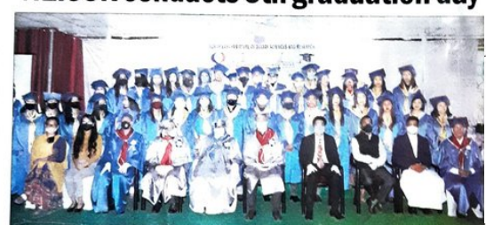
Graduating students with special guest and other dignitaries on December 8.