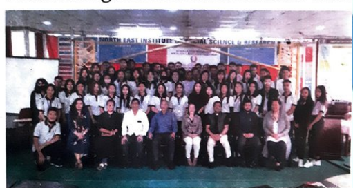
NEISSR students and other officials pose for a group photograph during a seminar on National Education Policy 2020 on February 27.