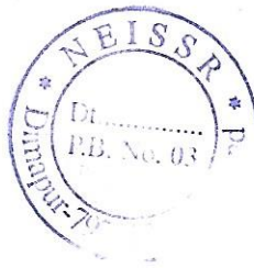
Principal North East Institute of Social Science & Research Dimapur-797112, Nagaland