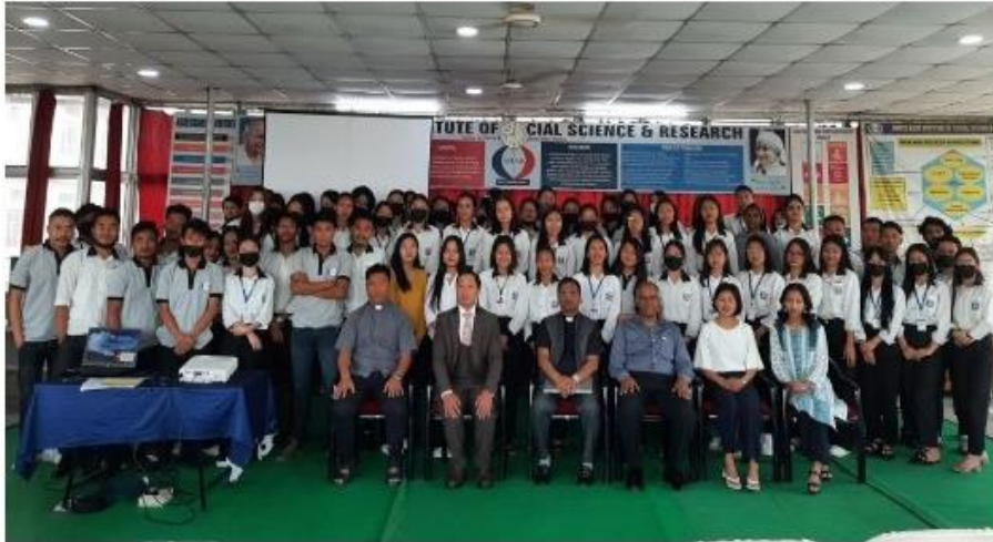
North East Institute of Social Sciences and Research, Dimapur organised two-day orientation programme on March 4 and 5.