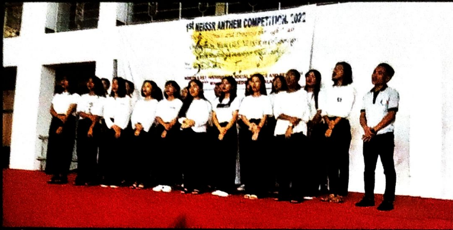
Winner of 1st NEISSR Anthem Competition, 2022 Music Club